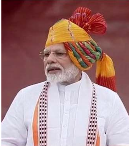
Shri Narendra Modi Prime Minister of India

“ .... I declare from the Red Fort today that in the days to come, we will take forward the Jal Jeevan Mission. The Central and the State governments will jointly work on this Jal Jeevan Mission . We have promised to spend more than Rs. 3.50 Lakh Crores on this mission in the coming years.....in the next five years, we have to do more than four times the work that has been done in the last 70 years...”